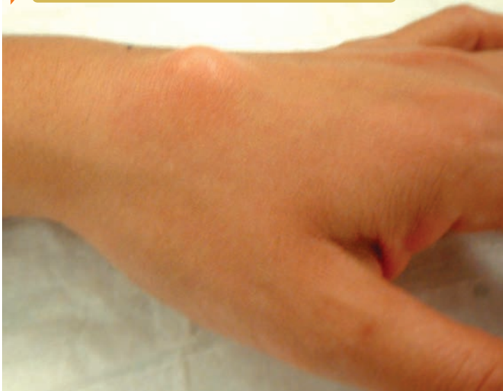
Figure 1: Ganglion top side (dorsum) wrist